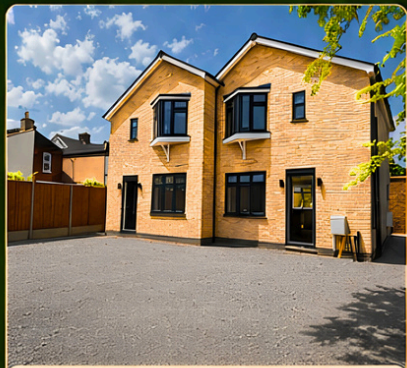
PROPERTY ACQUISITION TWO HOUSES + PARKING